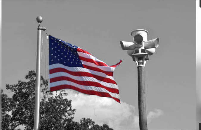
Proudly manufactured in the U.S.A.